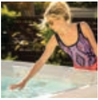
FreshWater® IQ System Ready