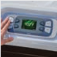
Color LCD Display