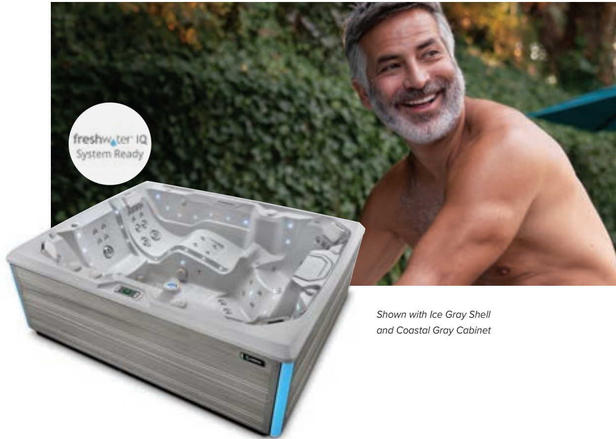
Shown with Ice Gray Shell and Coastal Gray Cabinet

People Seating Jets Voltage 7 Seats Lounge 73 Jets 230 V