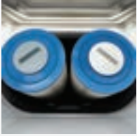
Dual Action Filtration SilentFlo Circulation