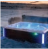
FiberCor® High-Density Insulation